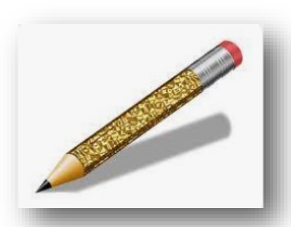
Golden Pencil Handwriting Award